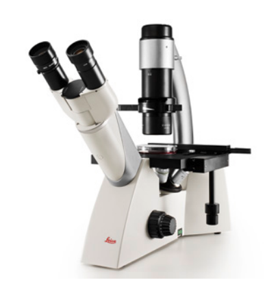
Cell check and documentation