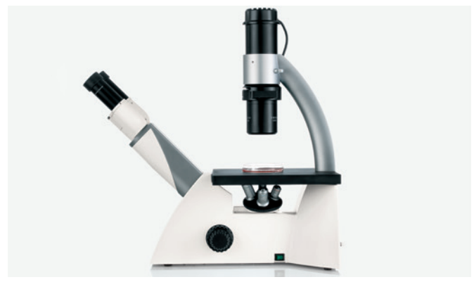
Quick check on cell status