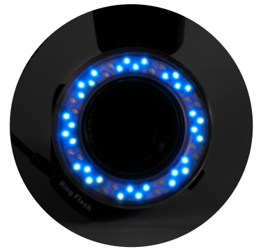
RING FLASHES AS PHOTO IS TAKEN