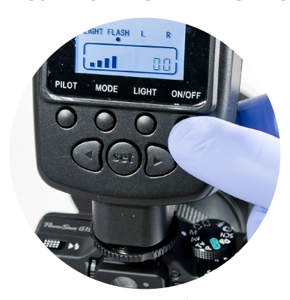
(FIGURE 3) HOLD FOR 2 SECONDS

The ringflash controller is attached to the hot shoe on the camera. To turn on the ringflash, press the controller's ON/OFF button (for approximately two seconds) (Figure 3) until the controller's LCD lights up. The ringflash contains two different colors of LEDs, white and blue (470nm). You can control the intensity (brightness) of the LEDs and you can choose to use only the left half of the ringflash, only the right half of the ringflash, press the controller's ON/OFF button for approximately two seconds.