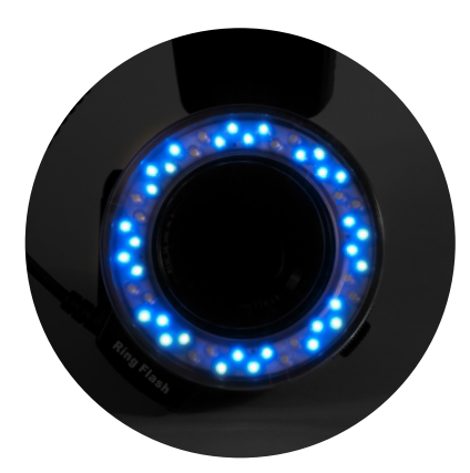
FULL RING STAY ON CONTINUOUSLY