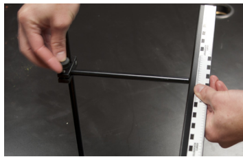
UNSCREW BRACKET LEVER ON WEIGHTED BASE ARM AND INSERT THE EXTENSION ROD. ADJUST TO CORRECT LEVEL AND TIGHTEN THE LEVER.