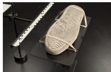
ATTACH LEVER AND PLACE OBJECT ON TOP OF PLATFORM. ADJUST TO PROPER LEVEL/ ANGLE FOR PHOTOGRAPHY.