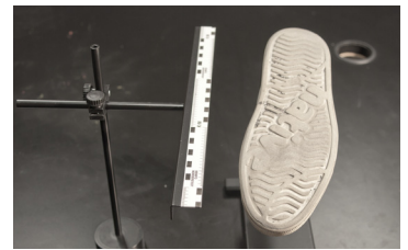
PLACE FOOTWEAR ONTO STAND AND ADJUST TO PROPER LEVEL/ ANGLE FOR PHOTOGRAPHY.