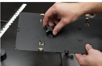
REMOVE LEVER ON THE BOTTOM OF THE PLATFORM.