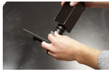
UNSCREW BRACKET LEVER ON STAND TO ADJUST THE LEVEL. MAKE SURE THE TOP OF THE STAND IS PARALLEL WITH THE BASE OF THE STAND TO ENSURE STABILITY.