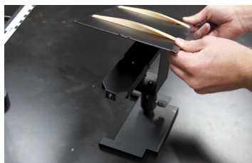
PLACE PLATFORM ON TOP OF STAND MATCHED THE HOLE ON THE STAND TO THE ONE WITH THE SCREW MOUNT YOU JUST REMOVED.